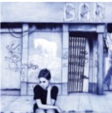
BROMANCE #9: TRANSCEND - EP (Bromance) 2013