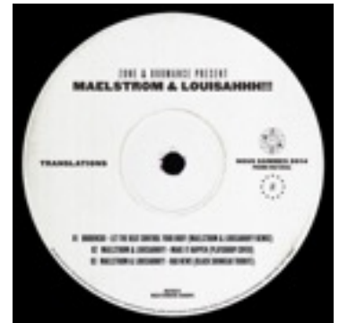
TRANSLATIONS - EP (Zone & Bromance) 2013