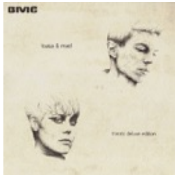
BROMANCE #15: TRACES - EP (Bromance) 2014