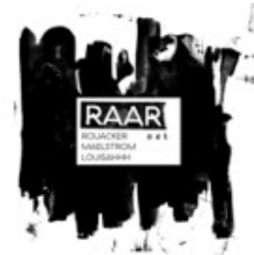
RAAR001 - EP (RAAR) 2015