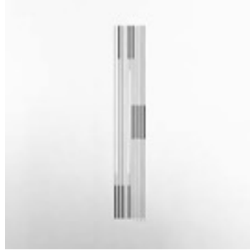
SHADOW WORK - EP (Bromance) 2015