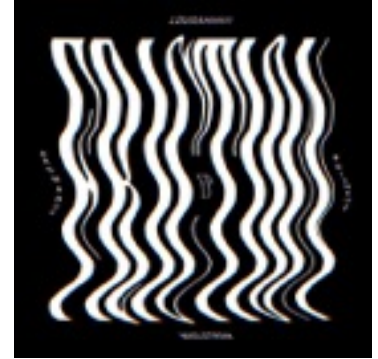
BROMANCE #19: FRICTION - EP (Bromance) 2015